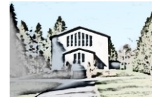
Our Lady of the Assumption, Templenoe