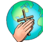
World Mission Sunday