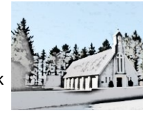
Our Lady of Perpetual Help, Direendarragh

Opening Hours: Monday to Friday 10.00 a.m. to 2.00 p.m. Sunday 15 th October 2023 ~ 28 th Sunday in Ordinary Time