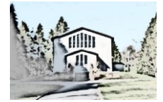
Our Lady of the Assumption, Templeoe