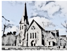
Holy Cross Church, Kenmare