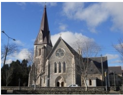
Holy Cross Church, Kenmare