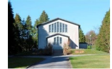
Our Lady of the Assumption, Templeoe