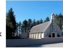
Our Lady of Perpetual Help, Direendarragh

Opening Hours: Monday to Friday 10.00 a.m. to 2.00 p.m. Sunday 22 nd October 2023 ~ 29 th Sunday in Ordinary Time