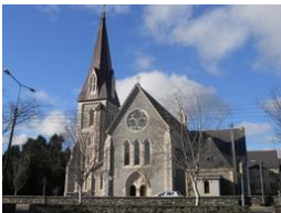
Holy Cross Church, Kenmare