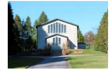
Our Lady of the Assumption, Templenoe

Direendarragh: next mass will take place on Tuesday 16 th January at 7p.m.