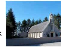
Our Lady of Perpetual Help, Direendarragh

Sunday 31 st December 2023 ~ The Holy Family