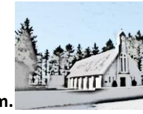
Our Lady of Perpetual Help, Direendarragh

Sunday 14 th January 2024 ~ Second Sunday in Ordinary Time