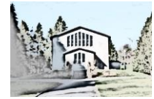
Our Lady of the Assumption, Templenoe

Direendarragh: Next Mass will take place on Tuesday 16 th January at 7p.m.