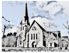
Holy Cross Church, Kenmare