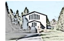
Our Lady of the Assumption, Templenoe

Templenoe: Next Mass will take place on 19 th March at 7p.m.