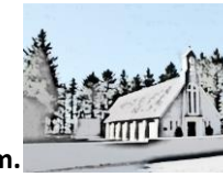
Our Lady of Perpetual Help, Direendarragh

Sunday 10 th March 2024 ~ Fourth Sunday in Lent