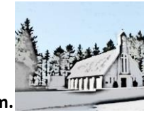
Our Lady of Perpetual Help, Direendarragh

Sunday 19 th May 2024 ~ Pentecost Sunday