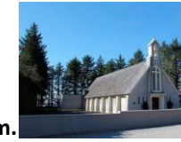
Our Lady of Perpetual Help, Direendarragh

Sunday 5th January 2025 ~ Second Sunday of Christmas