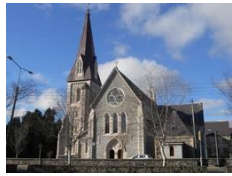
Holy Cross Church, Kenmare