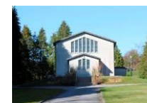
Our Lady of the Assumption, Templenoe