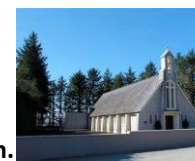
Our Lady of Perpetual Help, Direendarragh

Sunday 7 th December 2025 – Second Sunday of Advent