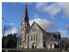
Holy Cross Church, Kenmare