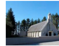
Our Lady of Perpetual Help, Direendarragh

Sunday 21 st June 2026 - 12 th Sunday in Ordinary Time